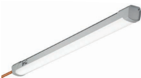
ZALUX BASE PMMA